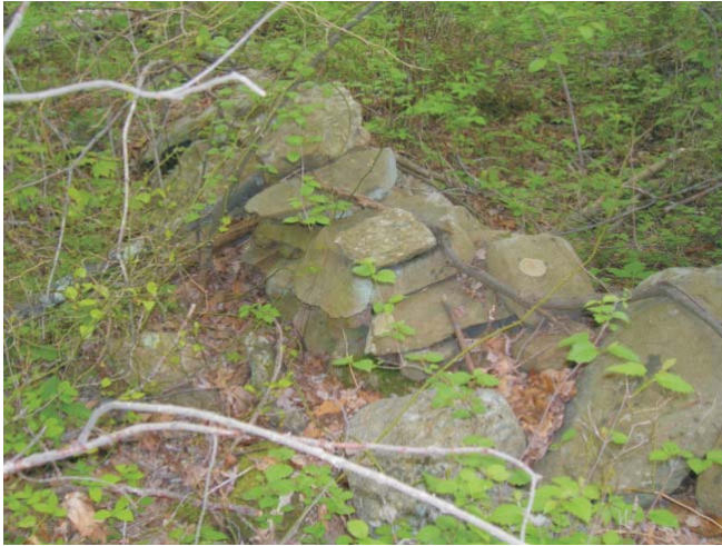
Segment of stone wall in poor condition looking south from Riverfront Reroute temporary workspace.

HRA Gray & Pape is providing technical oversight for cultural resource issues associated with the Weavers Cove Energy LNG facility and Mill River Pipeline in Massachusetts. The firm is developing a Treatment Plan to mitigate adverse effects of the undertaking to several Native American Sites, and is coordinating project elements with the Massachusetts Historical Commission, FERC, and the Advisory Council on Historic Preservation. The projects involve the construction of an LNG terminal, associated pipeline laterals, staging areas, meter stations, temporary workspace, and offshore dredging and storage areas in Fall River, Freetown, Somerset, and Swansea.