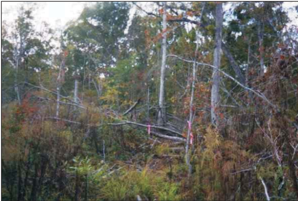
Overview of Cultural Resource CLA-008/22CK568. View is to the northwest.